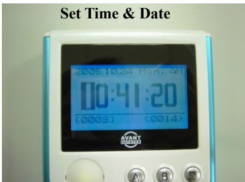
Set Time & Date

Once entering into Master Mode, press Menu Key to move to Time Setting page. The 1 st digit will be highlighted. Press Key A to change the figure upward or Key B to skip to the next digit. Repeat the same until Time & Date are all set. Press Menu Key to save setting and skip back to Ready Mode.