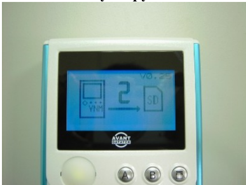
2 days copy